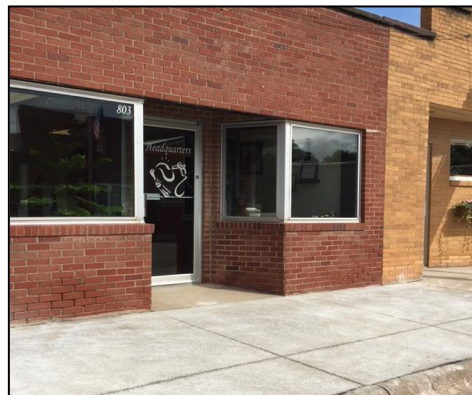
Riverview Financial's updated look & new, safer sidewalk outside of Headquarters.